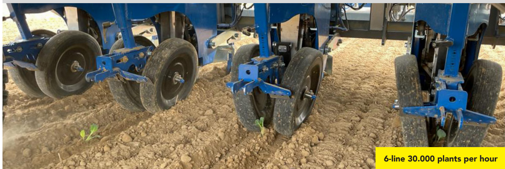
6-line 30.000 plants per hour