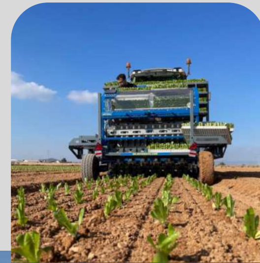
6-line also available in self-propelled