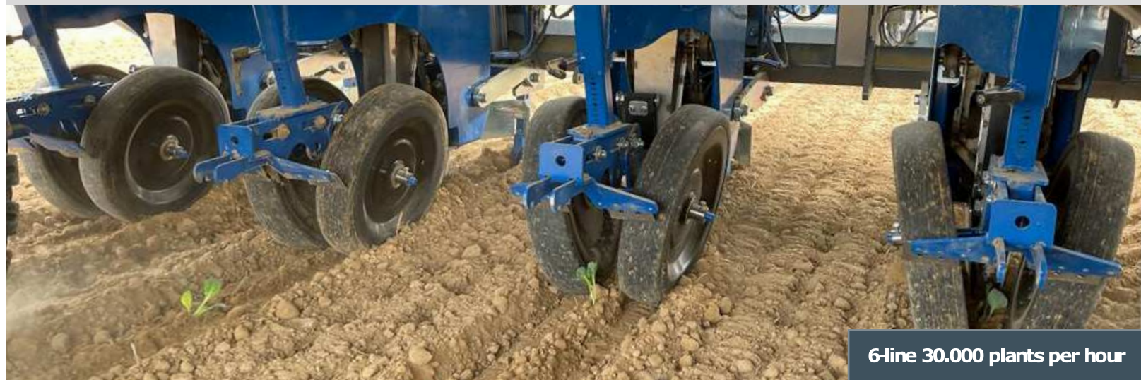
6-line 30.000 plants per hour